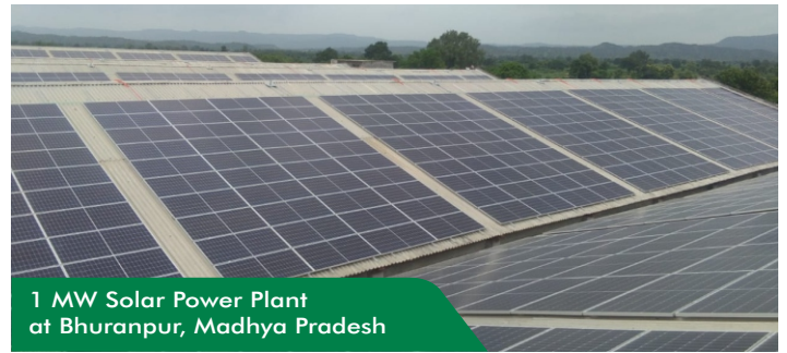
1 MW Solar Power Plant at Bhuranpur, Madhya Pradesh