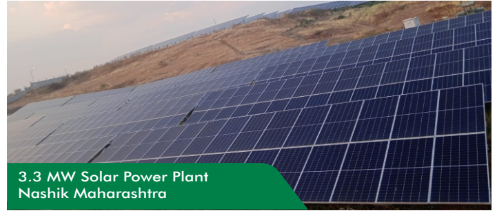
3.3 MW Solar Power Plant Nashik Maharashtra