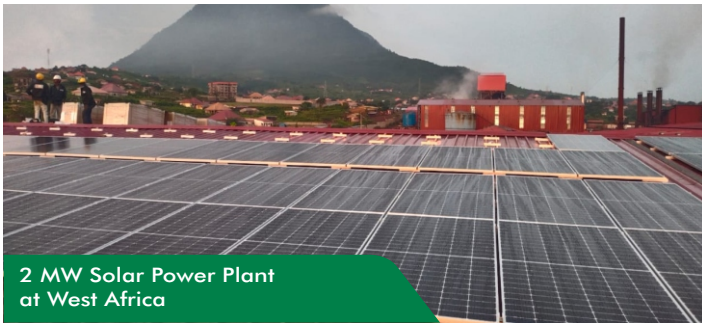
2 MW Solar Power Plant at West Africa