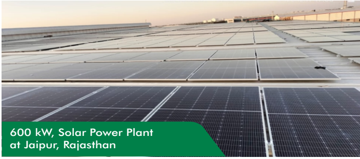
600 kW, Solar Power Plant at Jaipur, Rajasthan