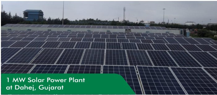
1 MW Solar Power Plant at Dahej, Gujarat