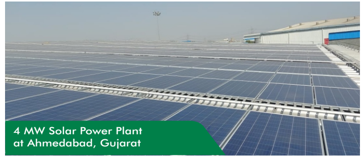
4 MW Solar Power Plant at Ahmedabad, Gujarat