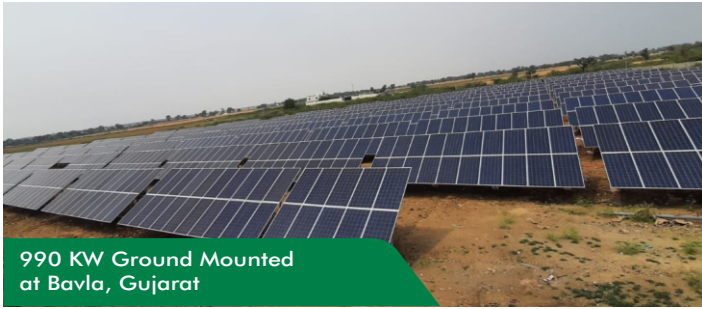
990 KW Ground Mounted at Bavla, Gujarat