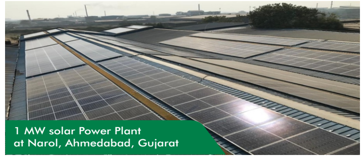
1 MW solar Power Plant at Narol, Ahmedabad, Gujarat